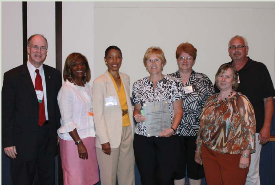
Members of Pennsylvania Housing Finance Authority present the award to members of UCP/CLASS' Residential Services.

In 2007, UCP/CLASS joined with Blue Roof Solutions to build a SMART™ home in the suburbs of North Versailles. With centrally controlled thermostats, automatic doors, motion-sensored lighting and other SMART™ technologies this became home to three other individuals. Financing for this home was made possible through a 0% interest loan from the Ewing Trust Fund operated by UCP National. Additionally a second ranch-style home was purchase and renovated in the Pleasant Hills area as a result of favorable financing from a local bank. Three people call this their home.